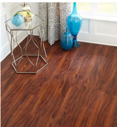
Victorian Russet LP5-HC7062-1