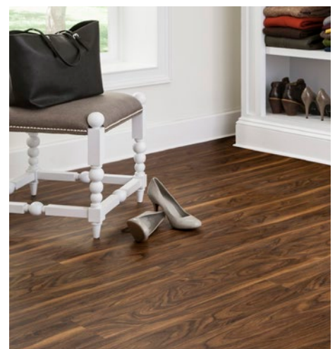
Walnut Tudor LP5-HC7280-5