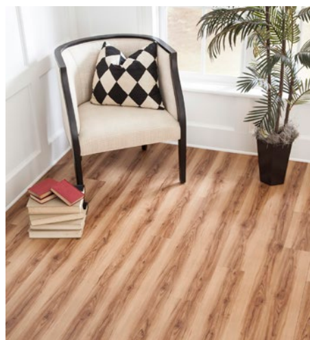
Northern Ivory LP5-HC7094-4